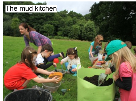
The mud kitchen

We met lots of people, local and from further afield, with the event gaining popularity as a Free Summer Activity. KHWP den making from old cardboard boxes and their mud kitchen, showed how to achieve easy and cheap entertainment, to keep children active during the summer break.