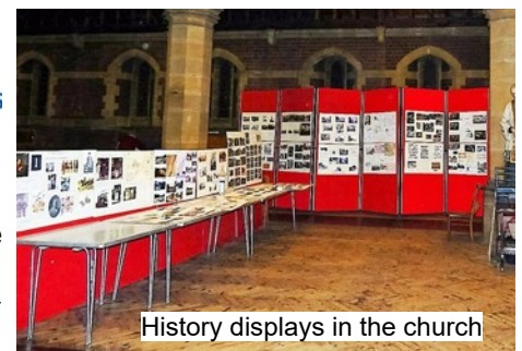
History displays in the church