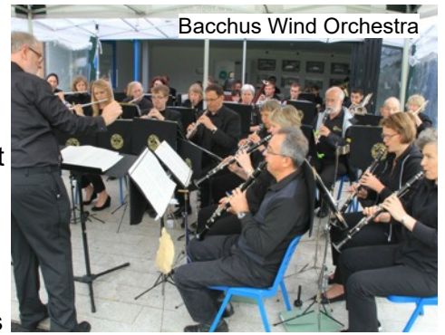
Bacchus Wind Orchestra

After assorted technical hitches, two gazebos were placed by the Hub to keep the musicians dry. The Bacchus Wind Orchestra eventually started their performance, which was enjoyed by everyone who turned out in the persistent rain.