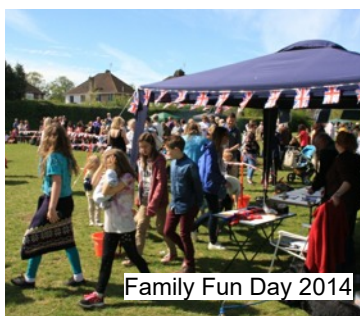
Family Fun Day 2014

During the year, the Friends group puts on a number of events, ranging from Community Planting Days to the Family Fun Day. These are planned and run by a small group of committee members, who put in an immense amount of time. We would love to have a few more volunteers to help with the events.