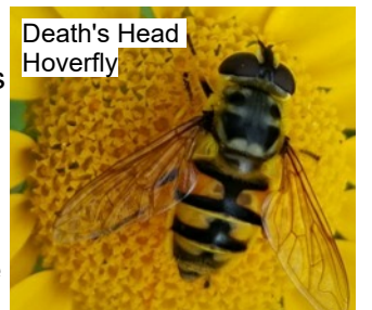
Death's Head Hoverfly