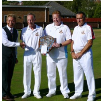
The tournament winning triples team

The club has been able to attract four new members thus far, with a hope that we will find another couple. The clubhouse facilities have now been well and truly tested and it is a pleasure playing home games back at Grosvenor. We are just waiting to get the honours board back on the wall.