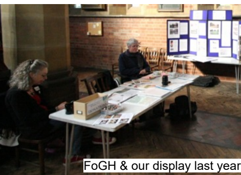
FoGH & our display last year

Displays will continue in St Barnabas Church & School as in previous years.