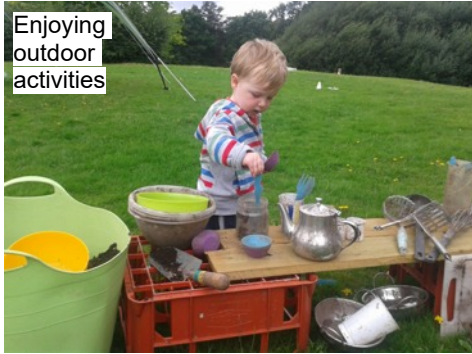
Enjoying outdoor activities

We are delighted to announce that the Park has received its first Green Flag this summer, thanks to the hard work of FoGH and the TWBC Parks Team. This award recognises and rewards the very best green spaces across the UK.