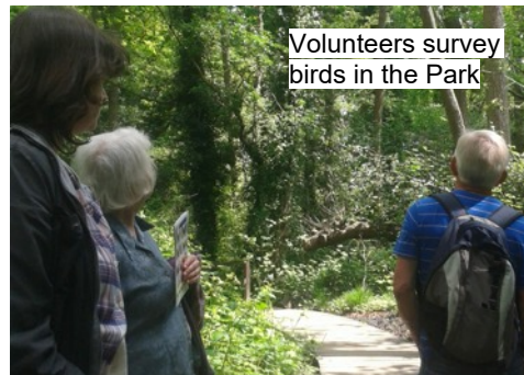
Volunteers survey birds in the Park

The conservation volunteers have been hard at work all summer, with activities from weeding the beds by the bowling green to getting to grips with monitoring the Park's wildlife. The wildlife surveys have created a great opportunity for the volunteers to learn about birds, butterflies, and the bees in the Park.