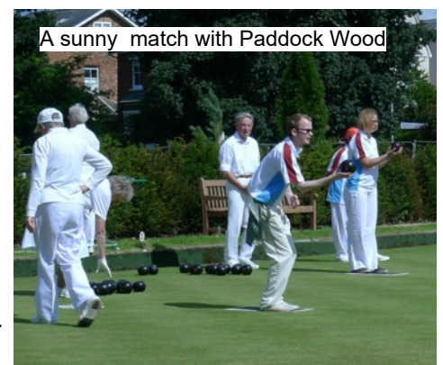
A sunny match with Paddock Wood

Saint John's Yard FC will still be playing at Hilbert in Division 3 of the West Kent Sunday Football League. There is a change to their strip: gold shirts, black shorts and socks this season. Matches begin in September on Sunday mornings: come and watch if you're in the Park.