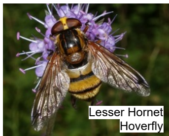
Lesser Hornet Hoverfly

We also encountered two of the largest British hoverflies, including the Translucent Hoverfly ( Volucella pellucens ). As its name indicates, this has a semi-transparent white band on its body, which helps the males to show up when performing their courtship display flight in the dappled sunlight of woodland glades.