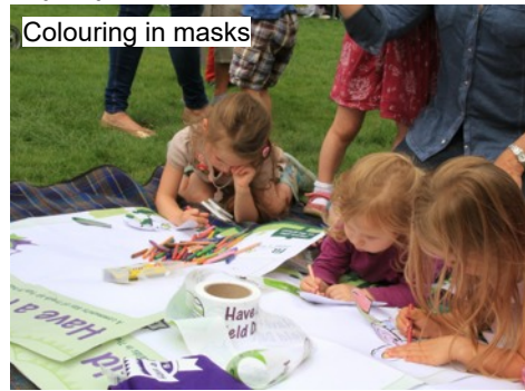
Colouring in masks

For the fifth year we joined Kent High Weald Partnership at National Playday, held in the Park, near the skate-park. There were lots of activities on offer and the day stayed dry,