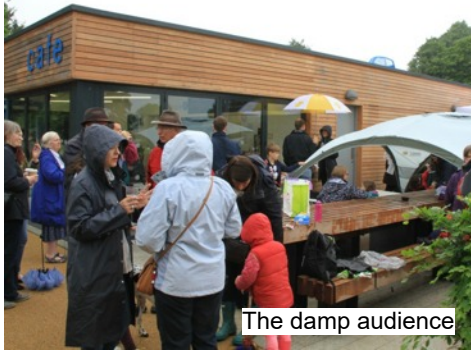
The damp audience

I hope the Queen appreciated our valiant efforts to join in national celebrations for her birthday. Heavy rain the day before, and more forecast for Sunday, meant moving the planned picnic into the Hub.